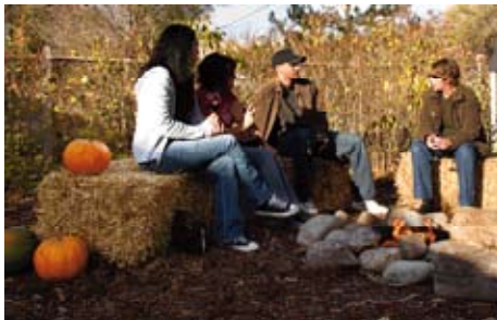
Entertaining done right) Conversations are sparked by an enticing scene and good food and drink.