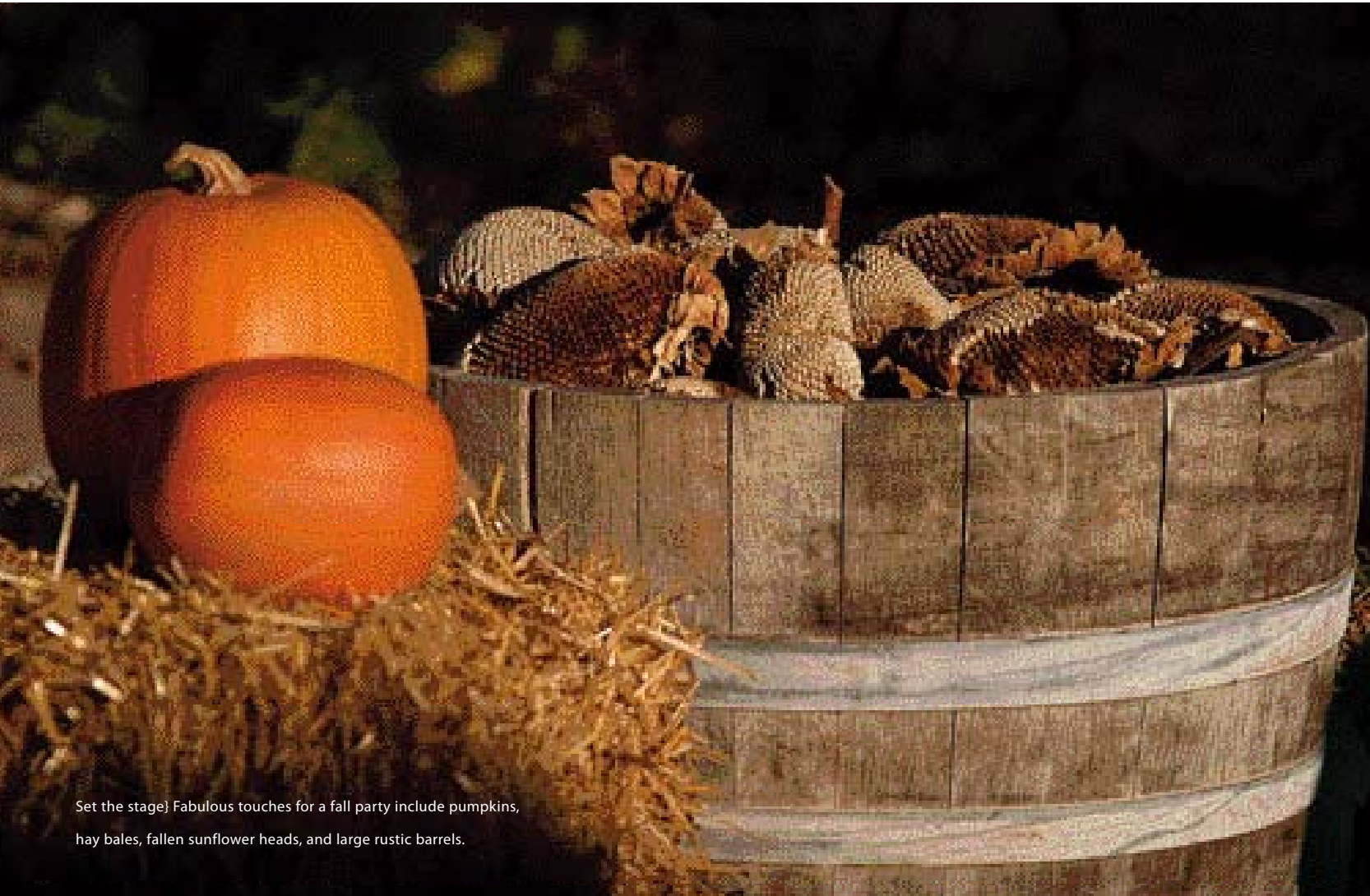
Set the stage! Fabulous touches for a fall party include pumpkins, hay bales, fallen sunflower heads, and large rustic barrels.